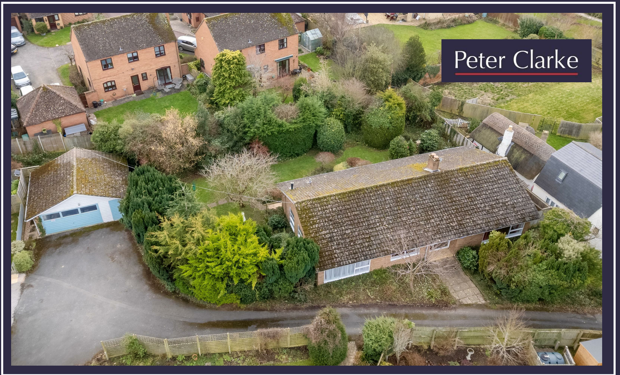
Orchard House, Gloucester Lane, Mickleton, GL55 6RP